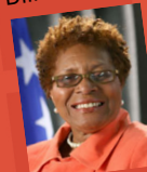
Cora Cole-McFadden, Mayor Pro-Tem